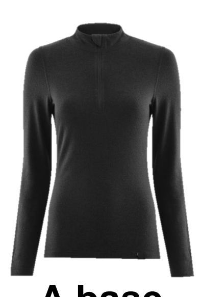
A base layer